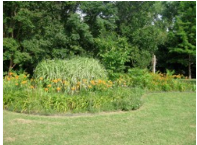
Recent picture of neighborhood garden.

The WHHA will dedicate some of our dues to an additional cleanup and installation of new plants and landscaping items, but we can always use more ideas, "sweat equity" and funding to make this project even better. If you are interested in assisting with this effort, please send us a note or give us a call. This entrance to our neighborhood can become even nicer, and we hope that you will help make it happen.